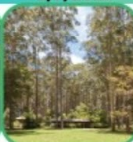
Bongil Bongil Excursion