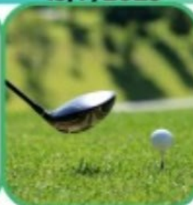
House Of Golf Excursion