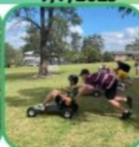
Beyond The Beanstalk Incursion