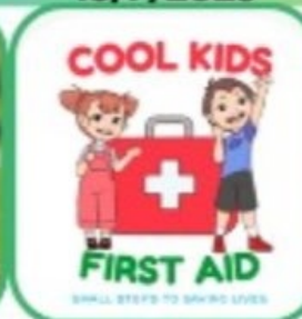
Cool Kids First Aid Incursion