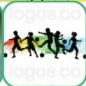
Sportz Central Excursion