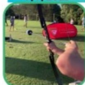
Evolve Archery Incursion