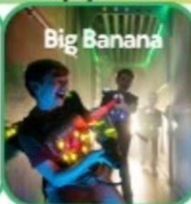
Laser Tag Excursion