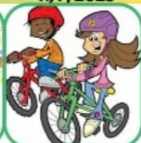
Wheels Day Incentre