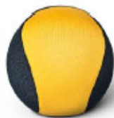
Water Skimming Bounce Ball

If your child has ten silver tokens (or 1 gold token) they can order these fabulous rewards on their next banking day. The final day to order rewards this term to ensure they arrive before the end of the year is Wednesday 4th December.