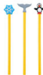
Polar Pencils and Pencil Toppers